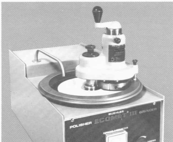
ECOMET® III with AUTOMET® Attachment