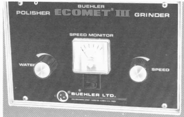
ECOMET® III Control Panel