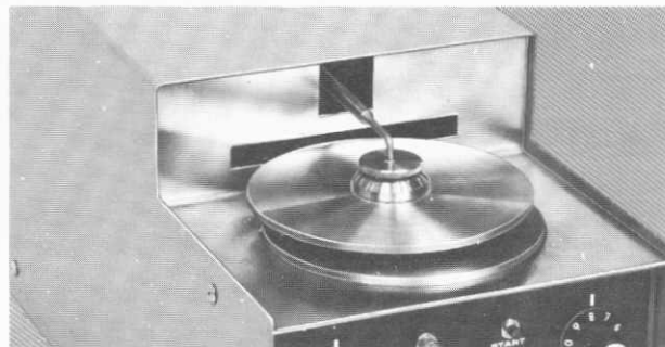
69-1560 Precision Thinning Attachment