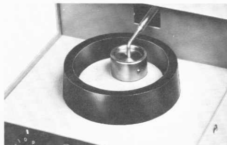
69-1590 Wafer Polishing Attachment

Available for operation on other electrical services.