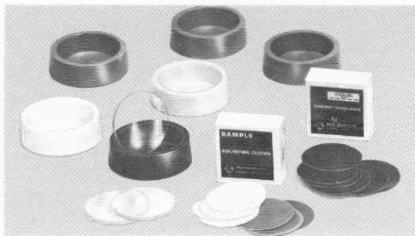
MINIMET® Accessories & Supplies

Approx. shipping weight: 25 lbs. (11 kg)