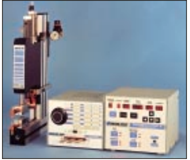
A PM6 system with Model X5 Unipulse Transformer and Model 180A air actuated weld head